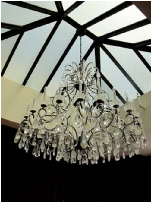
Chandelier and skylight.