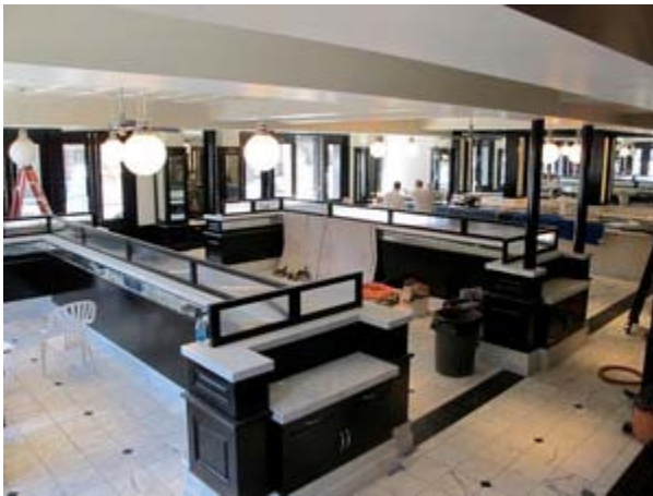
View of the main dining room.