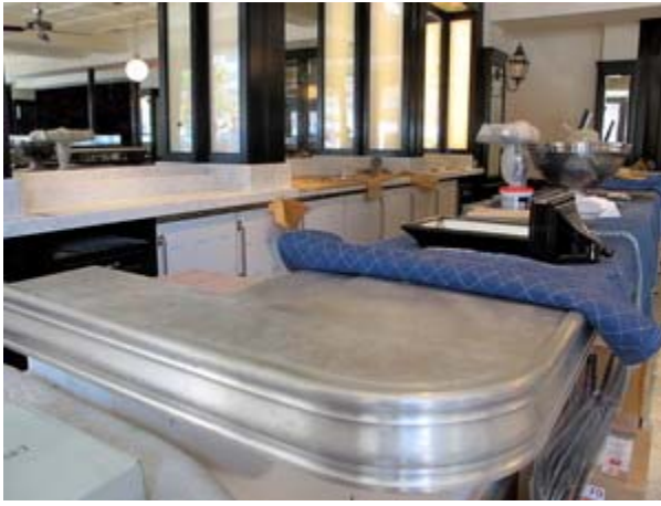
The bar of solid, poured zinc.