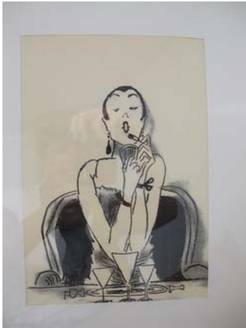
Vintage artwork for the back dining room.