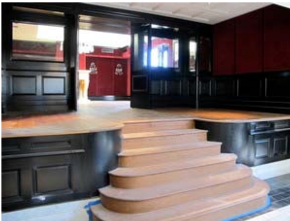
Stairs to the back dining room.